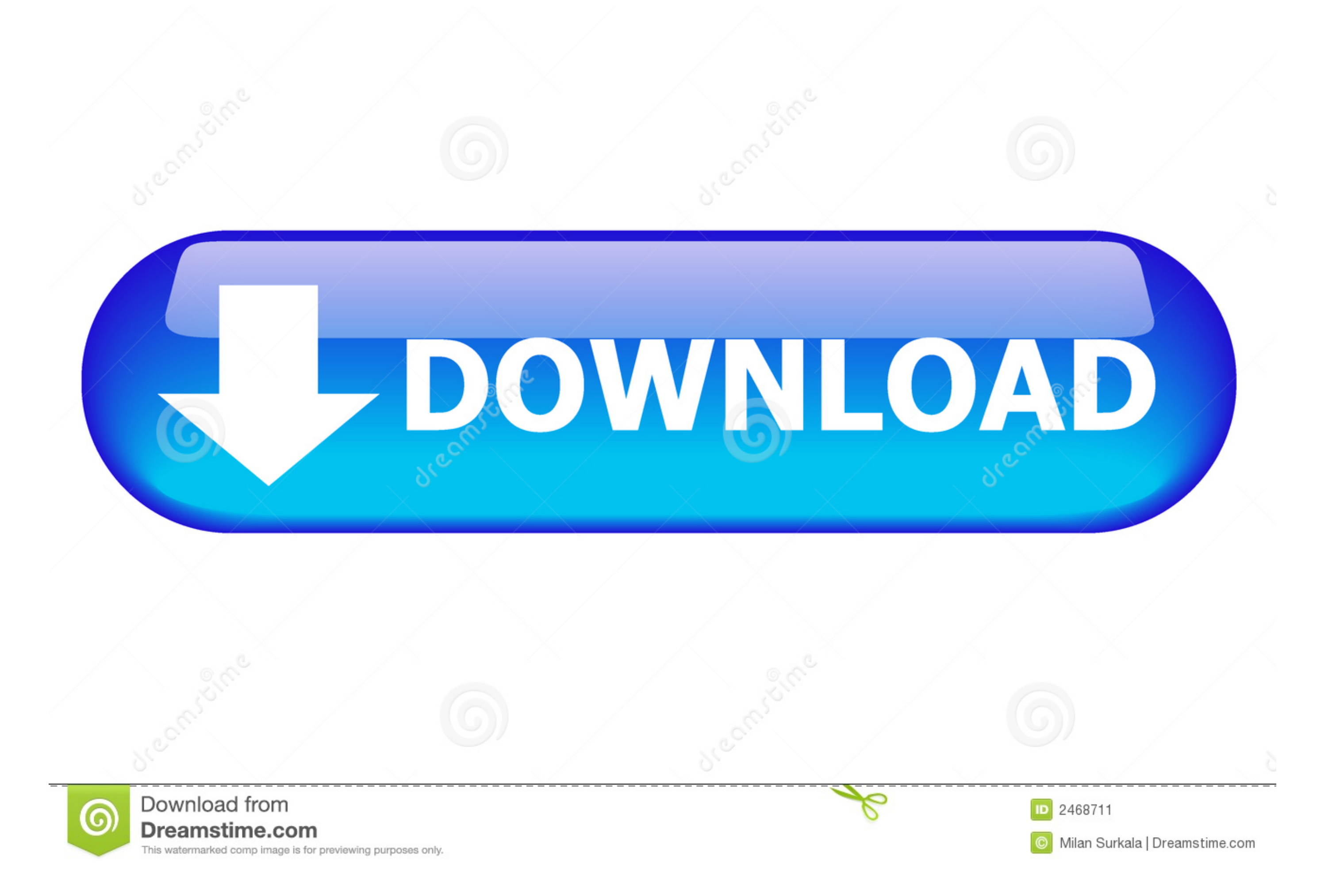
Activation Product Design Suite 2019 Portable